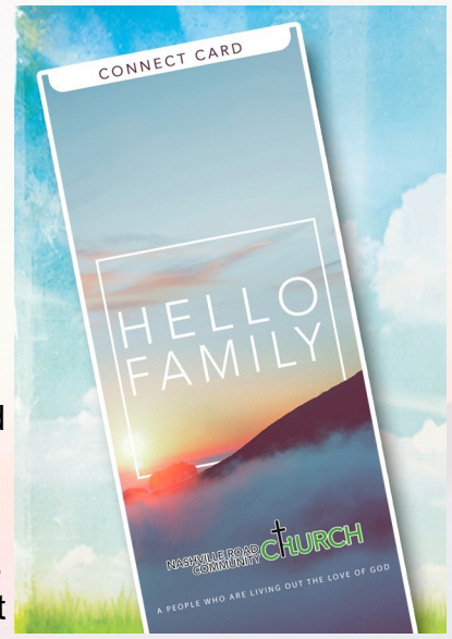
table in convenient card form! You can pick one up any time and place it in the offering plate on a Sunday or the Connect Card box

Church is a people who God's love and grace are changing! We get to be a large family! Families communicate the important stuff that's happening in their lives often around a dinner table! We'd love to celebrate, support and pray for one another when we hear about what's happening. One way to do that is with the Connect Card. Think of it as the family dinner